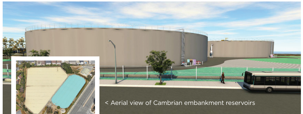
< Aerial view of Cambrian embankment reservoirs

San Jose Water's Cambrian Station currently consists of two large earthen embankment reservoirs with storage capacity of 12.1 million gallons and 3.9 million gallons, respectively. The first reservoir was originally constructed in 1890 and the second in 1921 — both have reached the end of their useful life. In 2024, we are starting a multi-year construction project to build two new tanks — providing 16 million gallons of potable water storage to our customers. For more info head to: sjwater.com/Cambrian .